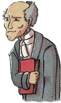
Chief Justice Francis Forbes